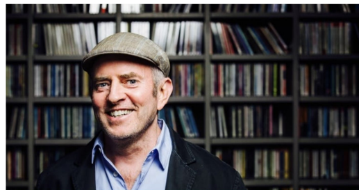
2020 Ohio Food Policy Summit November 16 - November 17

of Perfectly Imperfect Produce, and wrapped up with a brainstorming session to generate policy ideas to help set the OFPN statewide policy agenda moving forward. The Ohio Local Food Policy Council Workshop on day two prepared council members to operationalize their policy agenda. Topics addressed included how to incorporate different types of advocacy, steps in campaign building, and tools to move forward. If you missed this year's Summit and Workshop, check out the recordings below, and keep an eye out for follow-up emails from Ohio Food Policy Network on how to get involved.